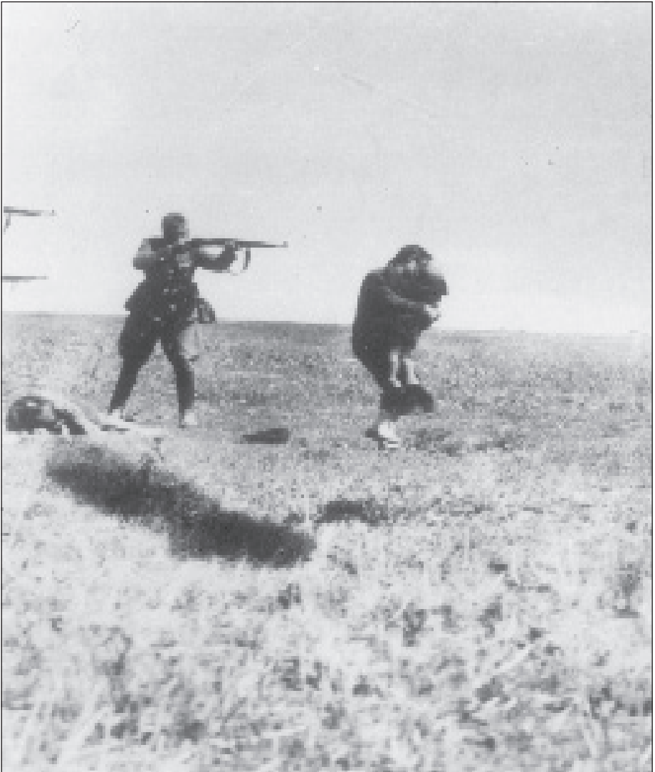
In front of a photographer, a German soldier takes aim at a Jewish mother and child during the slaughter of the Jews of Ivangorod, Ukraine, in 1942.