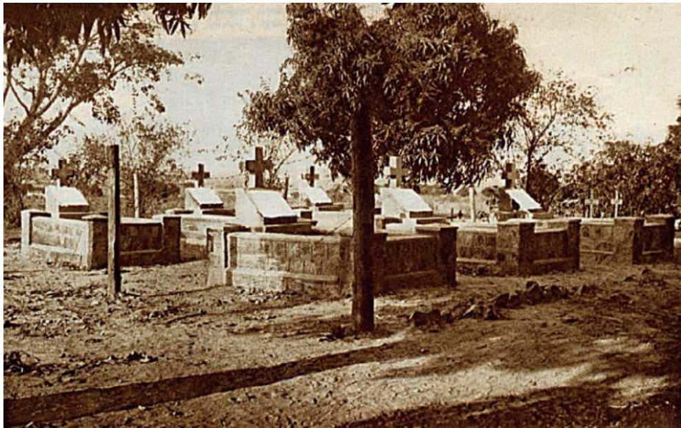
Louis Habran, "Tombes et cimetières belges de l'Est Africain", in L'illustration congolaise, no. 64, 1927, p. 1263.