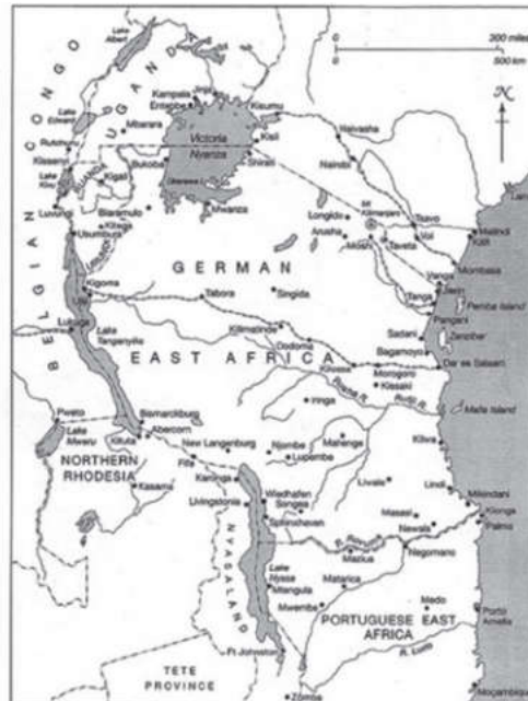
Theatre of War: Central and Eastern Africa

Edward Paice, Tip & Run. The Untold Tragedy of the Great War in Africa , London, Phoenix, 2008, p. xiii, xiv.