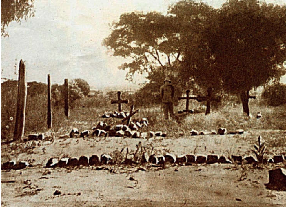
Louis Habran, "Tombes et cimetières belges de l'Est Africain", in L'illustration congolaise, no. 64, 1927, p. 1263.