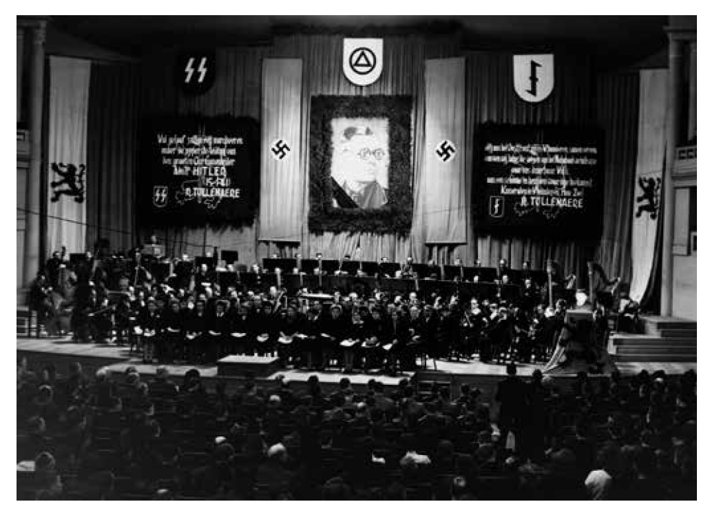
Commemoration of Reimond Tollenaere organized by the collaborationist Vlaams Nationaal Verbond (Flemish National League), Palais des Beaux - Arts, Brussels, February 8, 1942.