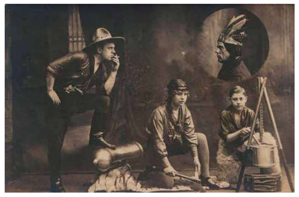
Picture postcard promoting a Wild West performance of the Otago Bill troupe.