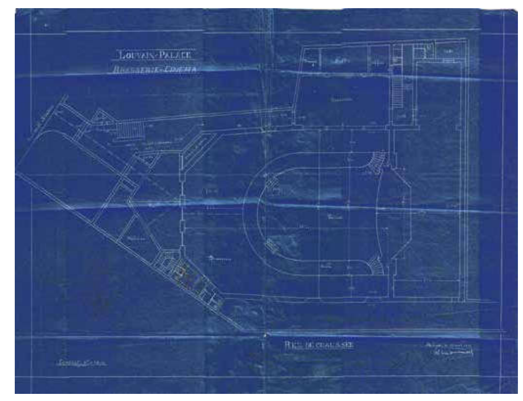
Architectural plan of Louvain-Palace Brasserie Cinéma, April 1914.