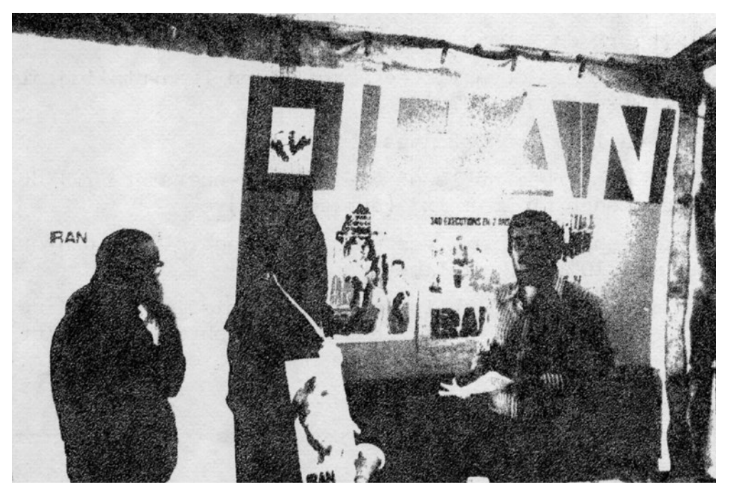
Picture of the CSI at the 12-13 November 1977 Peoples' Festival. Source: Le Bulletin d'information du Comité solidarité Iran, 4, December 1977, 15 (AMSAB-ISG, Comité solidarité Iran, PAD/2447).