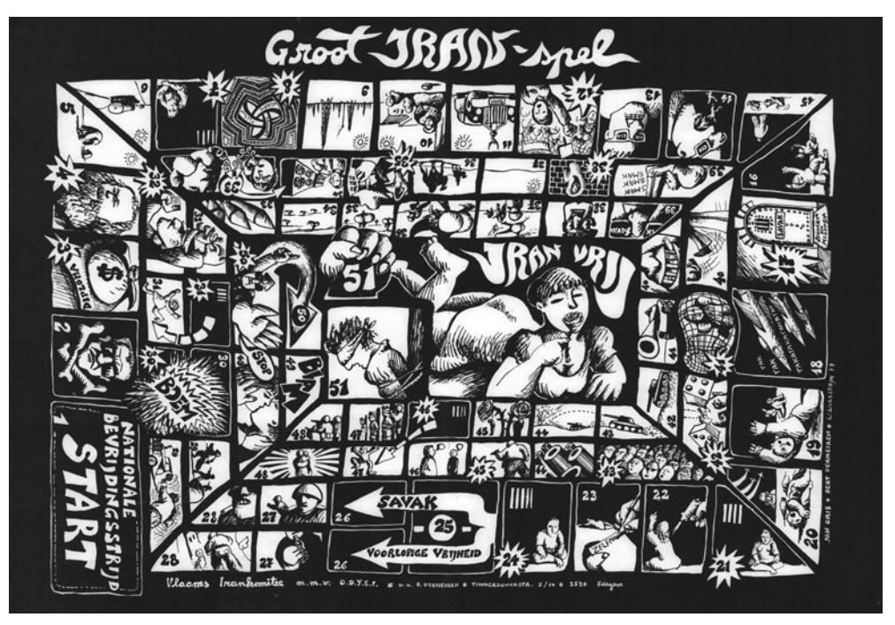
Poster representing the 'Fight for the National Liberation of Iran' as a board game, drawn by Willy Wolsztajn for the VIK, with the cooperation of the ODYSI in 1977.